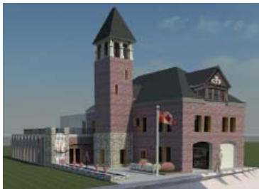
3D model: Galt Fire Hall

Don't fumble with pencil, paper & measuring tape. Contact Stiplosek Properties (Consulting) Ltd. to book your floor plans! Specializing in multi-tenant residential & industrial dimensioning.